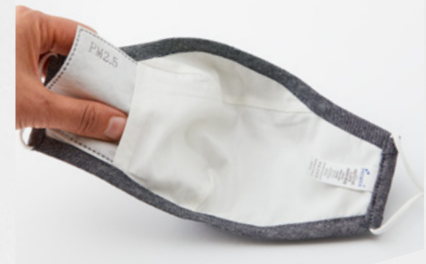
Pocket for optional Premier PR797 PM2.5 filter